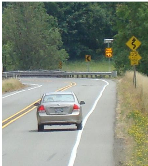
In-Radar Advanced Stats in use in two year CTRE study on dangerous road curves in the US