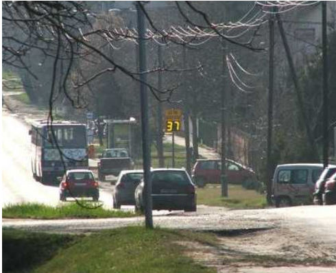
In-Radar Advanced Stats In Use