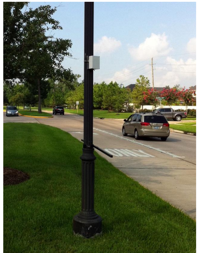
Armadillo mounted on light pole collecting data