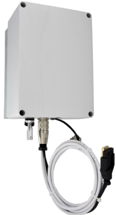
Armadillo Radar Stats Collector