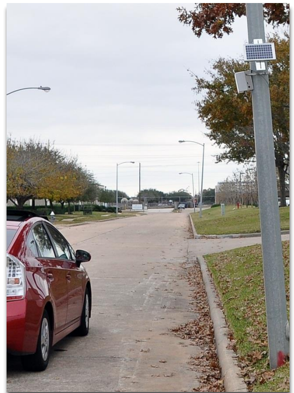
Armadillo mounted on light pole collecting data