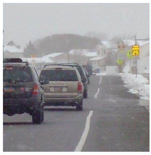
In-Radar Advanced Stats In Use