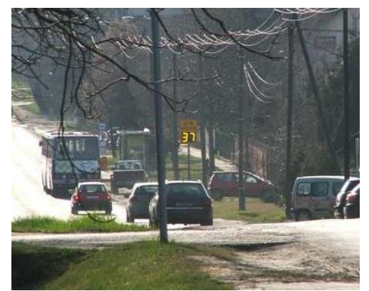
In-Radar Advanced Stats In Use