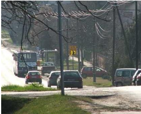
In-Radar Advanced Stats In Use