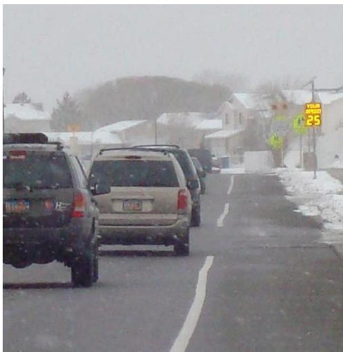
In-Radar Advanced Stats In Use

Many radar based speed signs are offered with a so-called “statistics package” option. However in most cases, it is implemented in a simple logic in the display software that monitors the speed sent out by the radar. It then calculates the 85 th percentile speed, average speed, vehicle count etc.